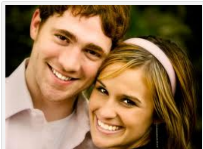
How to Get Boyfriend Back