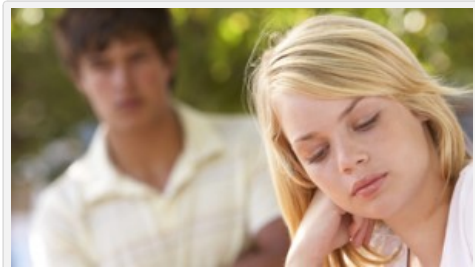
Get Ur Ex Back

Getting your ex back is possible if you follow the rules and requirements of a successful relationship. So, continue reading to know suggestions about getting your ex girlfriend back .